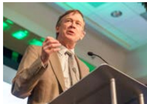
Governor Hickenlooper charged Colorado with developing a hub for water data at the Colorado Water Congress Annual Convention in January 2017.

This is showing up at Colorado's lead water policy and protection agency. The Colorado Water Conservation Board (CWCB) embarked this past winter on its first update of the Statewide Water Supply Initiative (SWSI) since 2010, when Dropbox was still in its in-