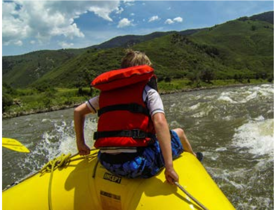
More comprehensive and open water data could facilitate involvement for more Coloradans in making decisions that protect and improve the things they value including recreation, environmental health, local food production, and safe drinking water.

Nathan Coombs serves as chair of the Rio Grande Basin Roundtable. Located in the southern part of the state, the Rio Grande Basin encompasses some 8,000 square miles of high mountains and low-lying valleys, with 200,000 acres of wetlands. Every spring and fall, the entire Rocky Mountain population of sandhill cranes migrates through the basin. Endangered species like the southwest willow flycatcher and threatened bald eagle call this area home. Fewer than 50,000 people can claim to do the same.